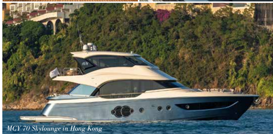
MCY 70 Skylounge in Hong Kong