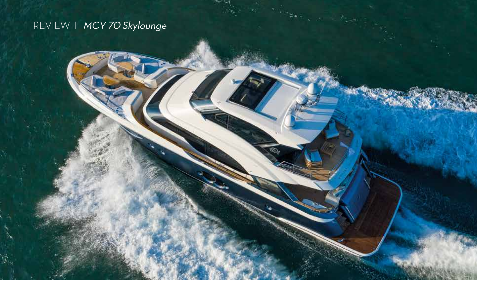
The MCY 70 Skylounge on the run in Hong Kong, home of regional dealer Asia Yachting, which represents Monte Carlo Yachts in Hong Kong, Macau and five key Southeast Asian countries

Asia Yachting is kicking off 2021 in lively fashion as the regional dealer hosts the Asian ‘reveal’ of the MCY 70 Skylounge online from Hong Kong and continues private viewings of the eye-catching new model.