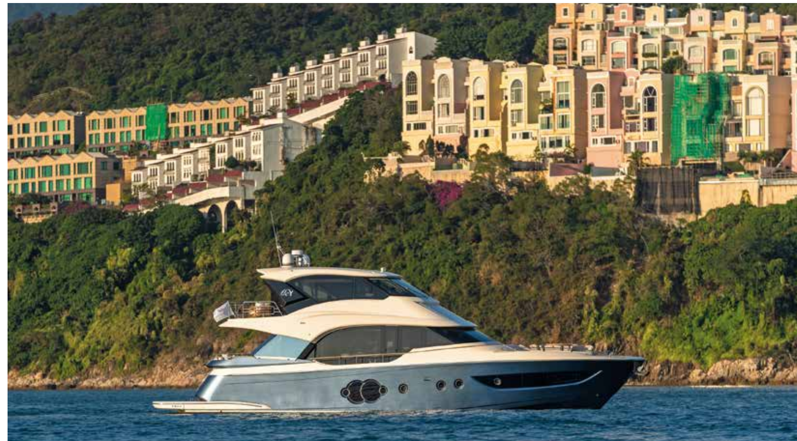
Asia's first MCY 70 Skylounge (also top) was photographed and filmed around the south side of Hong Kong Island including in Tai Tam Bay