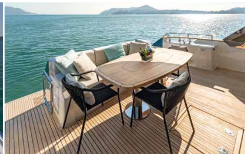
The yacht retains the flexible foredeck (left) of the MCY 70, one of three new MCY models in 2019; the aft cockpit on the main deck (right)