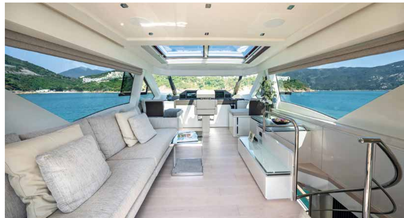
The spacious skylounge includes huge side windows, a retractable skylight, the sole helm station, and stairs to the saloon on the main deck

An oversized TV in the ceiling panelling can be lowered or concealed at the press of a remote-control button. To port, just inside the cockpit doors, is a day head carefully concealed behind dark chocolate brown-coloured wooden louvred slats. This space can be alternatively configured as a storage room or for access below deck to crew quarters and storage for the water toys.