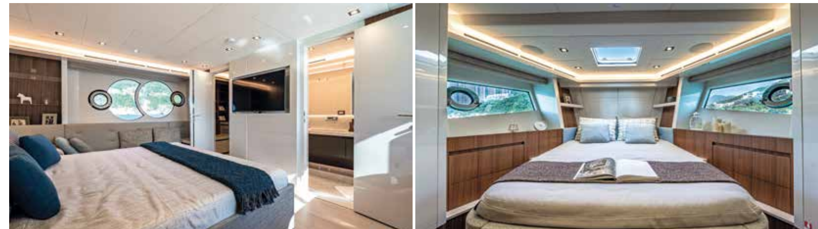
The full-beam master suite midships (left) has private access from the aft of the saloon and the shipyard's iconic overlapping circular windows; the VIP cabin (right) is in the bow

The guest cabins have separate access via another walkway from