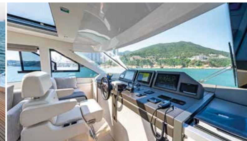
The aft deck of the flybridge (left) is a cosy nook, like a balcony for the interior skylounge; the skylounge houses the yacht’s sole helm station (right)

“When the yacht arrived, I was particularly impressed by the cosy feel of the intimate terrace at the back of the flybridge – great for two people or a couple to relax and have a private moment. It would be a good spot to enjoy a cigar.”