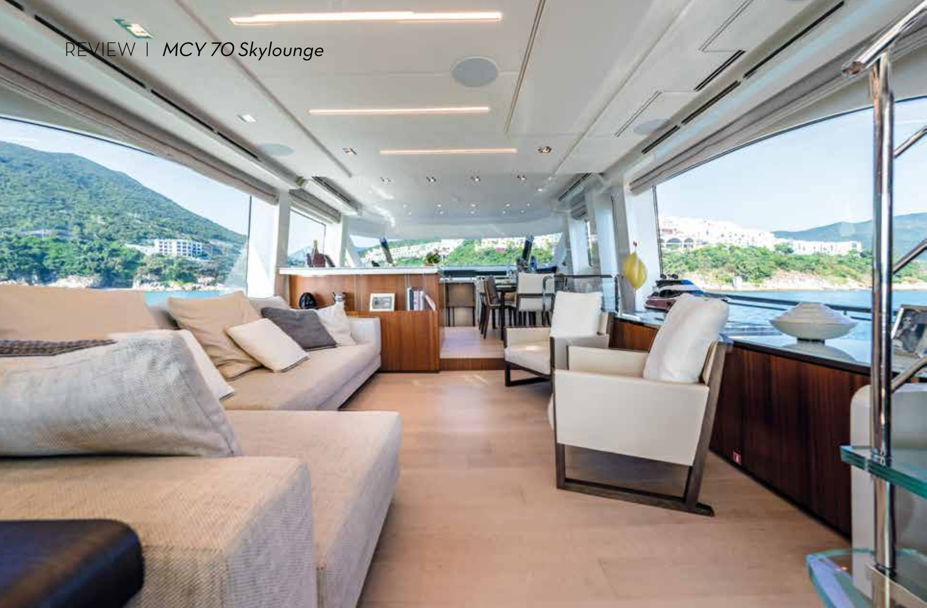
As well as starboard stairs to the skylounge, the saloon features a large galley and dining area forward, in a space partially occupied by the helm station on non-Skylounge models