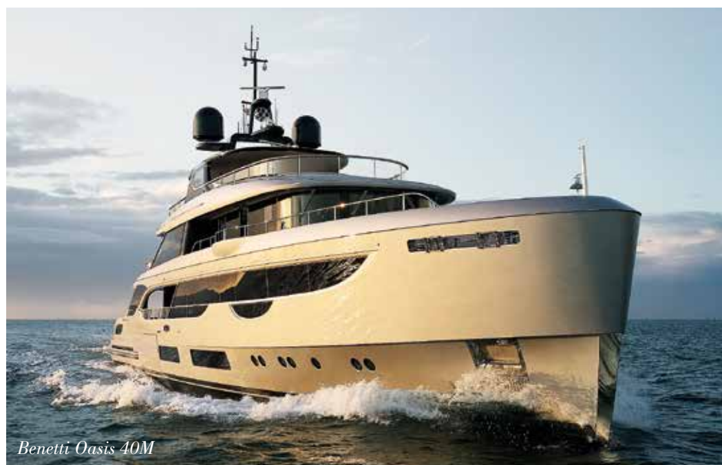
Benetti Oasis 40M