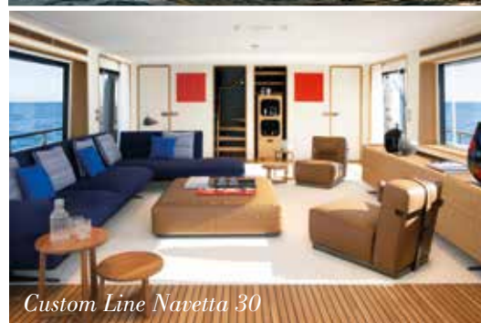
Custom Line Navetta 30