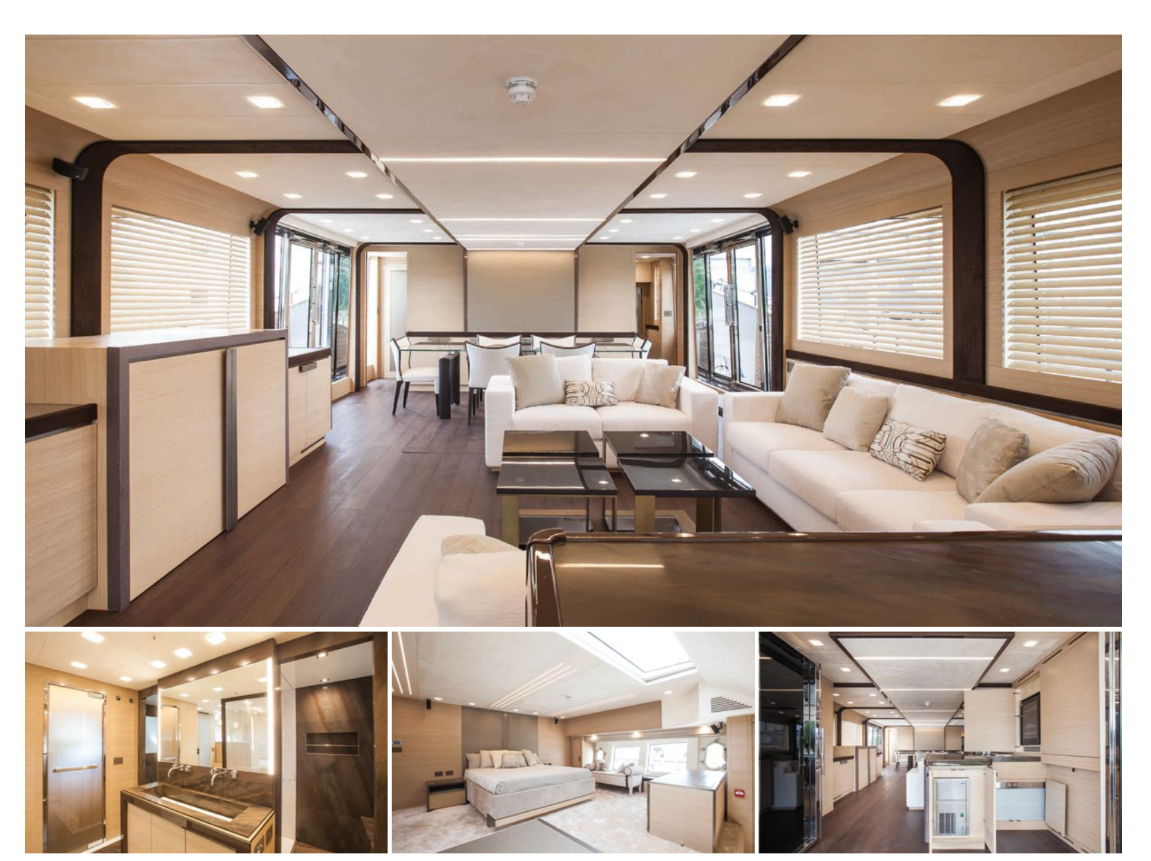
Opposite page: the Portuguese Bow with cosy seating; exterior colour scheme is the owner's choice; main saloon with a more traditional arrangement for seating and storage; the bar conceals the dumbwaiter; light and spacious owner's cabin; marble highlights in the owner's cabin and ensuite

The younger boat owner possibly enjoys an adventurous and active lifestyle, and wants a boat arranged to accommodate larger groups for social occasions. In which case the layout design would focus on outdoor activities, incorporating a larger beach club area and positioning the Jacuzzi on the back deck, with the main saloon arranged for a relaxed and casual lifestyle.