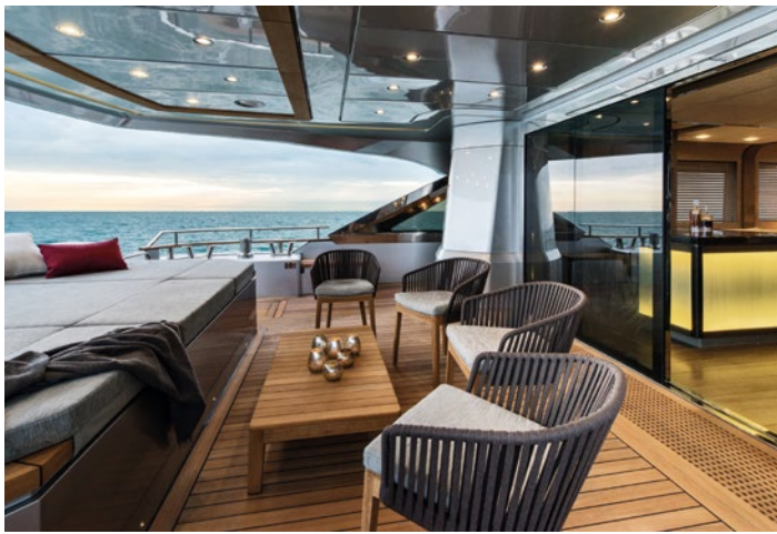
Clockwise from opposite page: MCY 105; spacious layout of the Portuguese deck on the bow; flybridge that can be configured for both large and small groups; a Jacuzzi on the aft deck, and the main saloon that is stylish and casual

reating the superyacht of your dreams requires a great deal of decision-making in the early stages. Monte Carlo Yachts have simplified the process by offering owners a great platform on which to design their dream yacht.